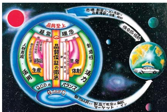
「品質至上」の概念図 Principle of “Quality Supremacy”

We believe that our most important asset is our human resources, as people are the source of our vitality and the drivers of our enterprise growth. The foundation of our company is to contribute to our customers and society through our human resources and to ensure both corporate growth and employee satisfaction. At the same time, we continue to work toward creating an eco-friendly company of the future.